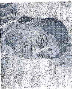
Sushma Swaraj, External Affairs Minister

According to diplomatic sources, enthusiasm within the Nawaz Sharif government